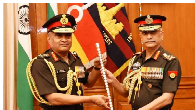
General Manoj Pande (L) took over as Army Chief from General MM Naravane.

also have to coordinate with the Navy and the Indian Air Force on the government's plan to roll out theatre commands.